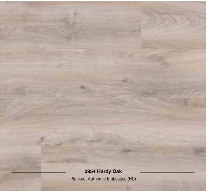
5954 Hardy Oak Planked, Authentic Embossed (HO)