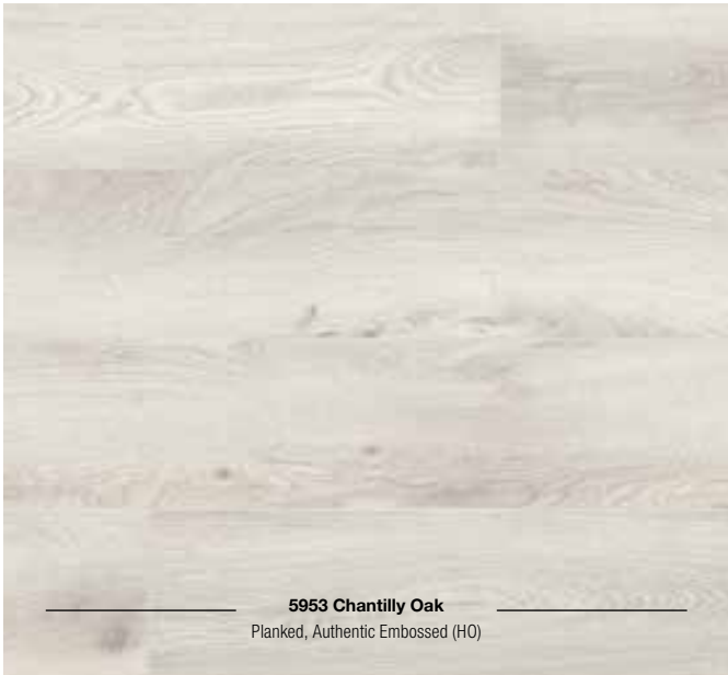
5953 Chantilly Oak Planked, Authentic Embossed (HO)

AC5, Class 33, 2000 x 242 x 12 mm 4 panels/box = 1.94 m 2 /box