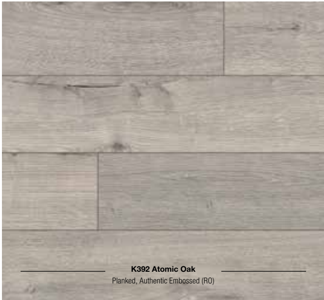
K392 Atomic Oak Planked, Authentic Embossed (RO)