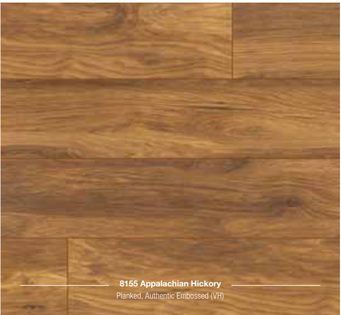
8155 Appalachian Hickory Planked, Authentic Embossed (VH)