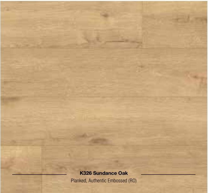
K326 Sundance Oak Planked, Authentic Embossed (RO)