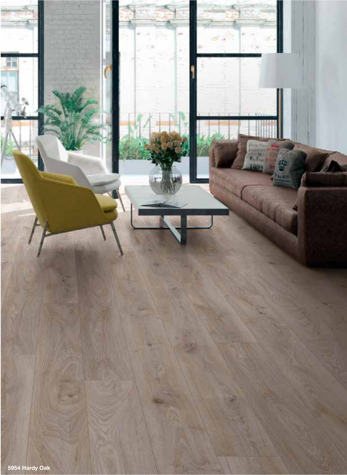
5954 Hardy Oak

AC5, Class 33, 2000 x 242 x 12 mm 4 panels/box = 1.94 m 2 /box